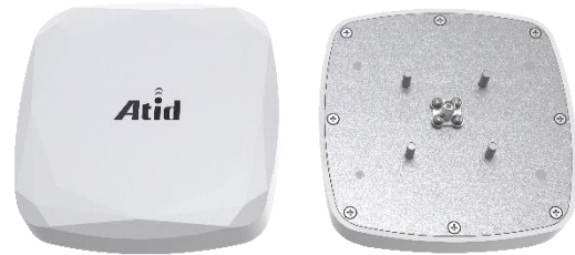
ATA802-BEN-A Type Antenna appearance dimension drawing