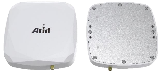
ATA802-BUS-B Type Antenna appearance dimension drawing