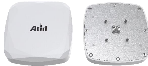
ATID-XC-AF802-BEN-A Type Antenna appearance dimension drawing