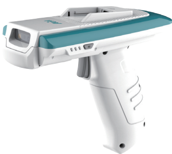
Barcode Reader Type