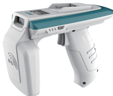
Built-in LCD Type