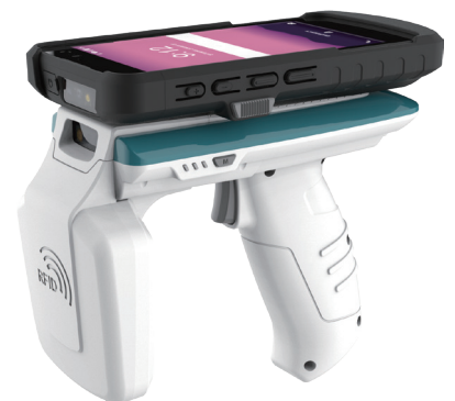
Mountable Phone case